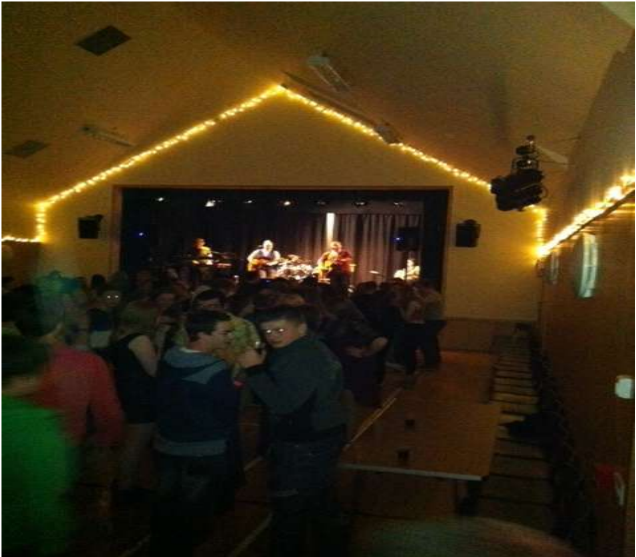
The Stereo Lobsters in action !!

The Longship held a fashion show in September with local models and all proceeds from the ticket sales and raffle went to the hall. It was a fantastic evening and very well supported. We were able to try out the new stage extensions, lights and sound system which worked really well.